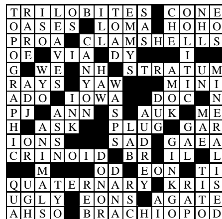
LAST MONTH'S SOLUTION: Some Fossils