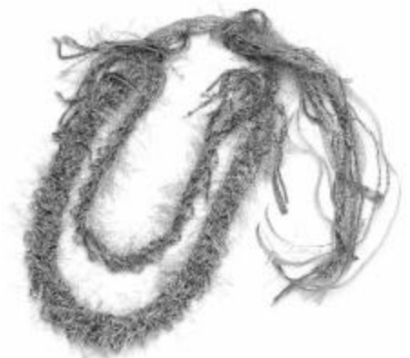
Bead Crochet.

Mixing beads with yarn, fiber or threads in multiple sizes and colors is a popular design style. Yarn can be used in hand weaving,