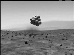
The Quarry Vest deployed.

In a joint release today (1 April, 2005) Graves, the manufacturer of lapidary equipment and NASA, the US Space Agency announced the development of the Quarry Vest™. The Quarry Vest™, intended for use by both quarry workers and rockhounds, is a 10lb vest studded with positional sensors. Using sophisticated electronics, the vest senses when the wearer is falling. In falls of greater than 10m, the vest deploys a series of air bags that cushion the wearer from impact. In preliminary trials, the air bags prevented serious injury/death in 95% of all cases. Side effects such as bruising, nausea and religious conversion were uncommon. Graves expects to market the vest for $350.00. In falls of less than 10m, the vest can be programmed to respond with one of several pithy sayings.